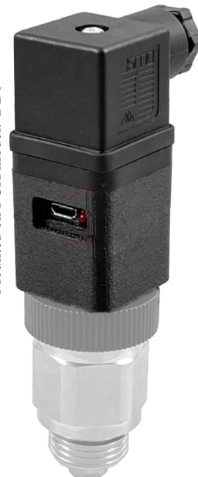
Mounted on FOX model: TT4