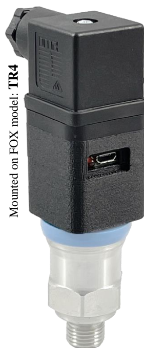
Mounted on FOX model: TR4